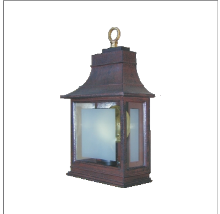
Empire Mini Sandblasted Glass with Clear Edge

HOUSING : LM 6 die cast aluminium. LIGHT SOURCE : The fitting is designed to operate a range of Compact Fluorescent lamps up to 18W or ES LED lamps. DIFFUSER : Standard sandblasted glass with clear edge. REFLECTORS : Aluminium or brass disc. FINISH : Powder coated and paint technique. MOUNTING : Wall mounted. CONTROL GEAR : Electronic or magnetic control gear. The electronic supply is suitable for operation with 220 – 240 volts, 50 hertz single phase. FASTENERS : All external screws are stainless steel. INGRESS PROTECTION : IP 44. MECHANICS : Operating Temperature ( T_a ) \leq 35^\circ\text{C} . Weight : 2.1 Kg including control gear.